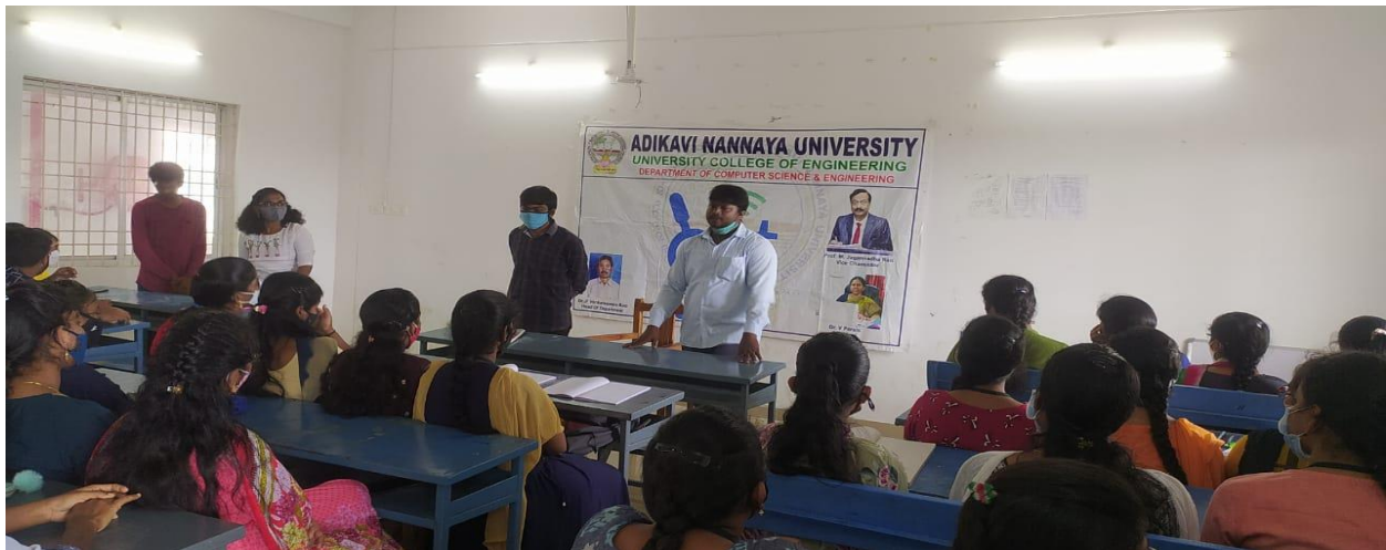
Faculty club Coordinator briefing about the Event and explain about rules and regulations