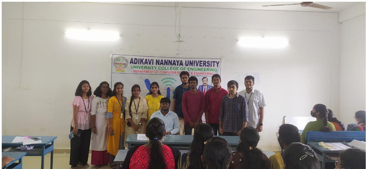
Student Club Coordinators of III B.Tech CSE actively participating in Orientation Programme.