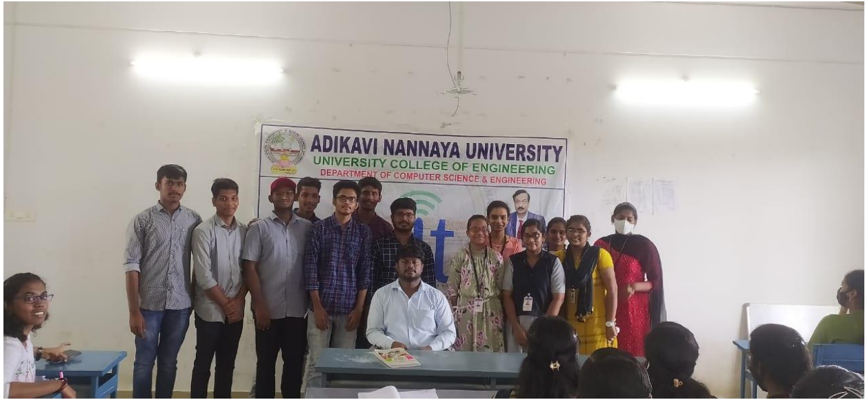
Selection of II B.Tech Students as Student Club Coordinators for the Upcoming Events.