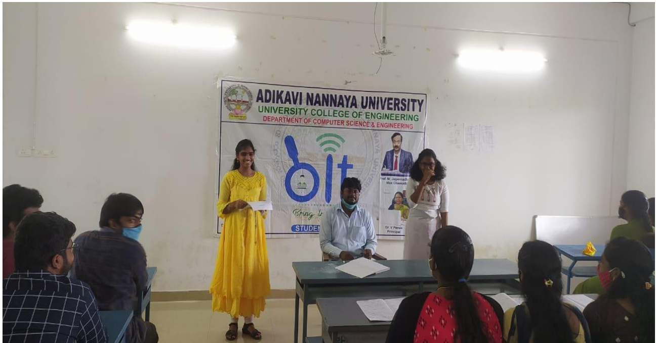
Welcome Note and Introduction about BIT-CLUB by III B.Tech Students Club Coordinators.