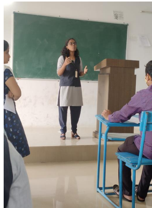
Department of CSE , Students actively participating in JAM Event.