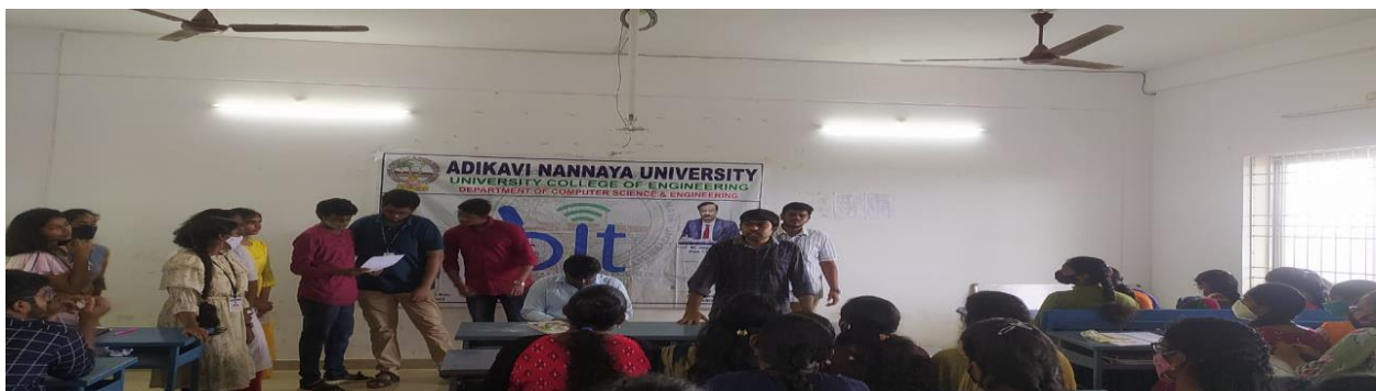
Department of CSE Students actively participating the Tech –Quiz programme.