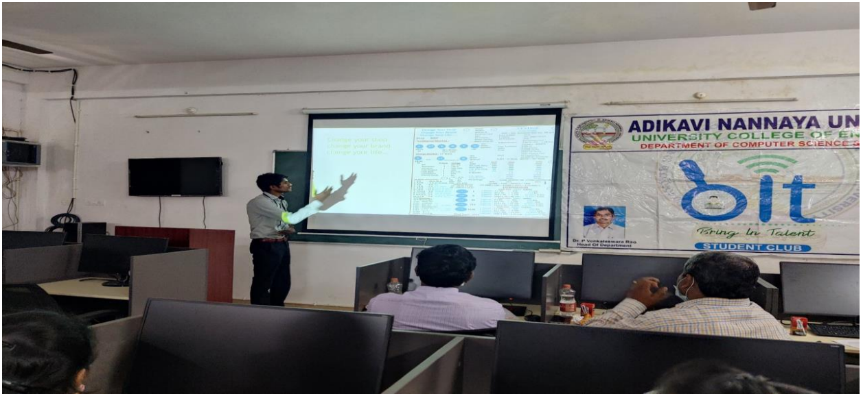
A student from Department of ECE actively participating and explain his innovative ideas.